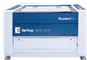
Fusion Pro 24 (CO2)